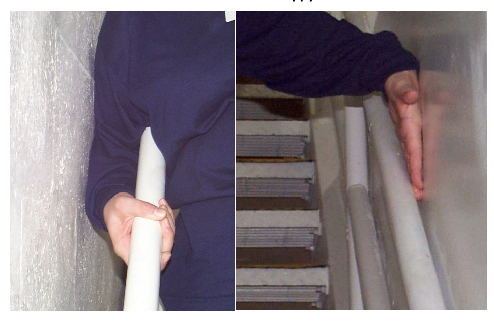
Ignorant or Careless Design or Construction