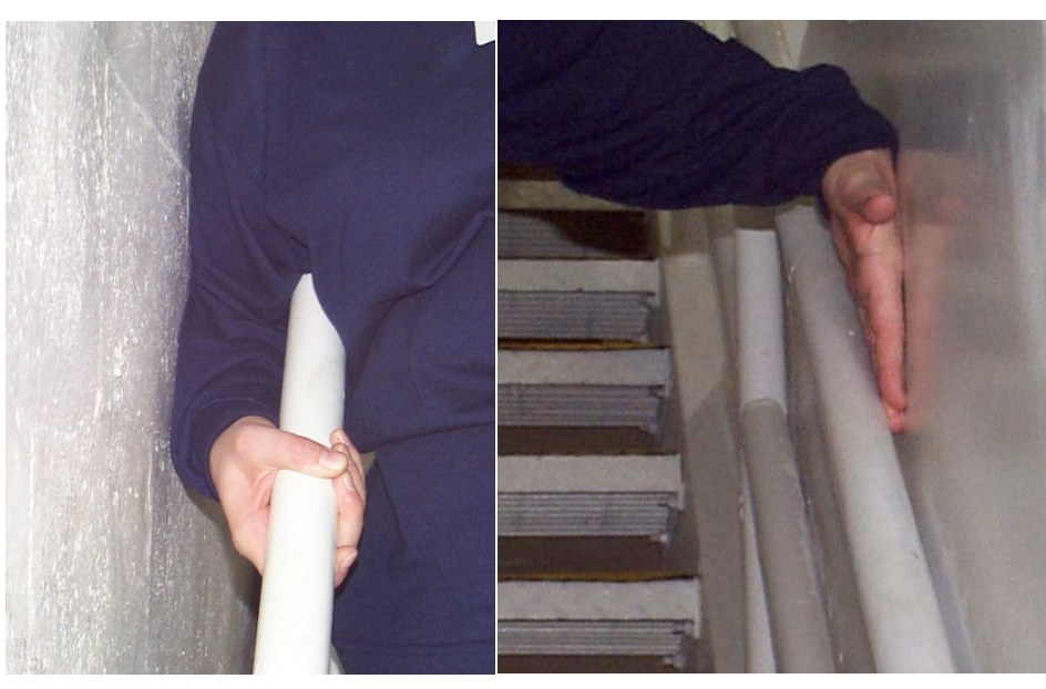
Ignorant or Careless Design or Construction